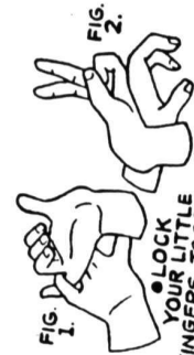
FIG. 1. FIG. 2.

• LOCK YOUR LITTLE FINGERS TOGETHER. DON'T LET GO! PLACE THE BACKS OF YOUR HANDS TOGETHER AND HOLD YOUR FINGERS AS SHOWN IN FIG. 2.